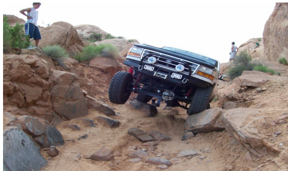
Kevin Ballew (instructor) in The Squeeze. This truck was built in the auto shop.

In addition, we will take field trips to various shops, races, and car shows for the total package. Come experience all the fun, You won't regret it!!!!